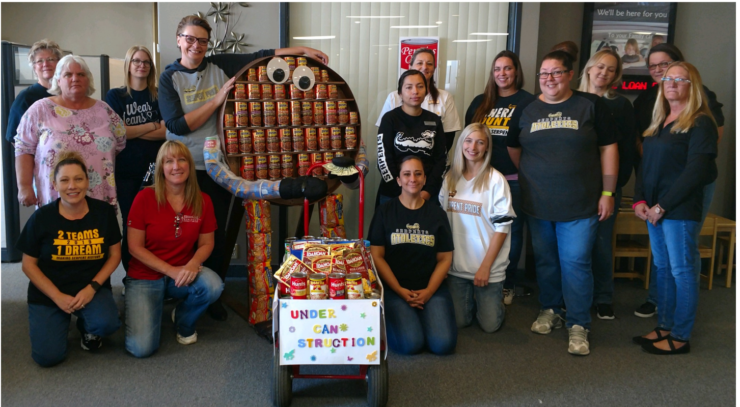
Financial Horizons Credit Union - Donated 156 canned goods and 122 dry goods!